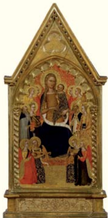
JACOPO DI CIONE (Florence, documented 1365 – 1398) Madonna and Child enthroned between St. Anthony Abbot, St. Mary Magdalen (?), a Bishop Saint, St. Catherine of Alexandria and eight angels Oil on panel 29 3/4 x 14 in., (75.5 x 36 cm.) (with modern frame) 18 x 10 in., (45.5 x 26 cm.) (painted surface) Moretti Fine Art Ltd

Each gallery, in the heart of London's St. James's and Mayfair, will stage a special display or event. Many of the paintings have an untold story, a fascinating history or an important and newly discovered provenance. Master Paintings Week appeals to collectors, curators and enthusiasts from all over the world and highlights the unrivalled expertise that is to be found in London.