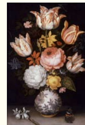
AMBROSIUS BOSSCHAERT THE ELDER (Antwerp 1573 –1621 The Hague) Roses, tulips, anemone, cyclamen and other flowers in a porcelain vase with a red admiral butterfly Oil on panel 14 1/4 x 10 1/4 in., (36.5 x 25.7 cm.) John Mitchell Fine Paintings

Boschaert was one of the founders of flower painting in Europe, and so the re-discovery of this picture in 2002 was significant. His technique of enamel-like glazes, gradually applied so that the brushstrokes all but disappear, gives the painting a timeless quality which belies its four hundred years.