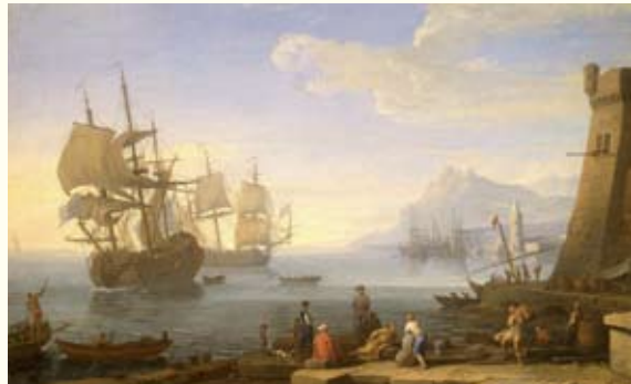
ADRIAEN MANGLARD (1695 – 1760, French School) A Mediterranean Harbour Scene Oil on Canvas, one of a pair 8 3/4 x 14 1/4 in., (22 x 36 cm.)

Van Dyck's 1640 Self-Portrait , his last, was one of the most arresting portraits painted in England in the 17th century. After his death it became the defining image of the artist, and inspired similar works by successors such as William Dobson and Peter Lely.