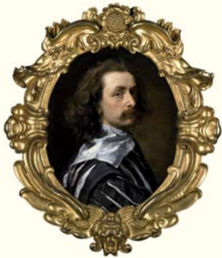
SIR ANTHONY VAN DYCK (Antwerp 1599 – 1641 London) Self-Portrait Oil on canvas 23 1/2 x 18 3/4 in., (59.7 x 47.3 cm.) Philip Mould Ltd

Van Dyck's 1640 Self-Portrait , his last, was one of the most arresting portraits painted in England in the 17th century. After his death it became the defining image of the artist, and inspired similar works by successors such as William Dobson and Peter Lely.